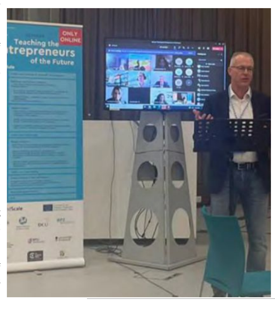
How is the course communicated to the students?

For more information about the seminar please follow the <u>link</u>